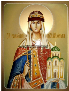
St Olga of Kyiv, pray for us.

We pray in the name of Jesus Christ, Amen.