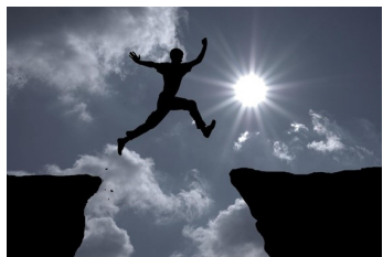
Pierre Teilhard de Chardin SJ from Hearts of Fire

Only God could say what this new spirit gradually forming within you will be. Give the Lord the benefit of believing that his hand is leading you, and accept the anxiety of feeling yourself in suspense and incomplete.