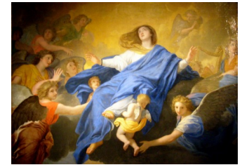
The Assumption of the Blessed Virgin Mary

Killybegs Employment Project vacancies: Domestic Worker/Activities Killybegs Caretaker Niall Mór Centre Killybegs Clubrooms & Parish Maintenance Inver/Ardaghey Caretaker Foresters Hall Killybegs Grounds Caretaker Killybegs Maintenance Workers Killybegs Youth Workers Killybegs Kitchen Assistants Killybegs Eligibility to participate on CE is generally linked to those who are 21 years or over and applicants must also be in receipt of a qualifying Irish social welfare payment for 1 year or more. To apply or to find out more information call the office on 0749731666 or email kepltd2@outlook.ie